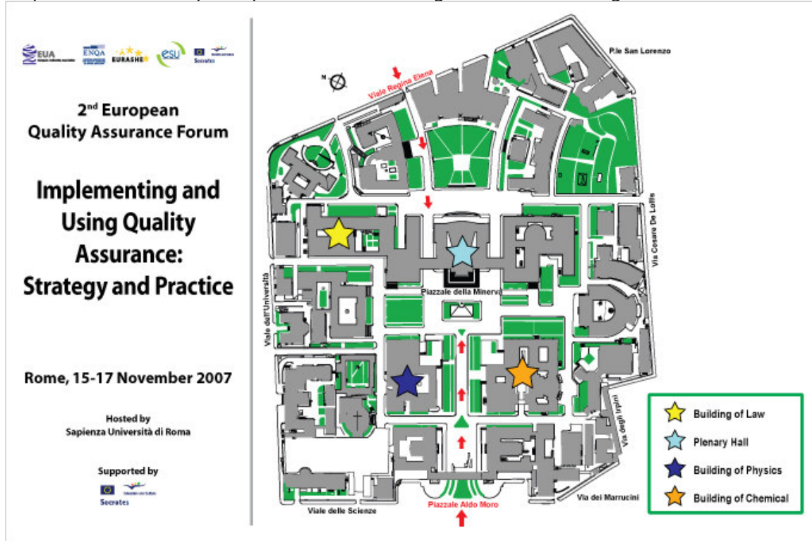
CARTELLO CM 300X200